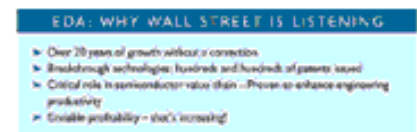
(click to enlarge) Figure 3. Why Wall Street is Listening